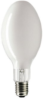
HPI Plus, E40